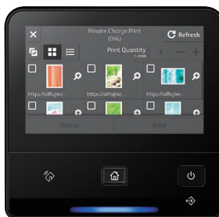
5-inch colour touch panel